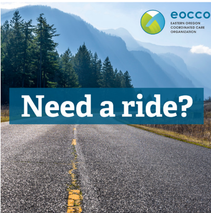
Download image #3